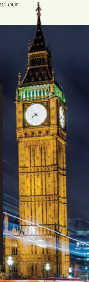
Karl Hick Larkfleet Group of Companies

“These brainstorming sessions, with some of the best minds in the industry are always insightful and informative.”